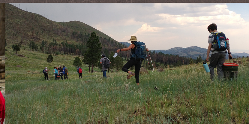
Students and teachers hike to a research site