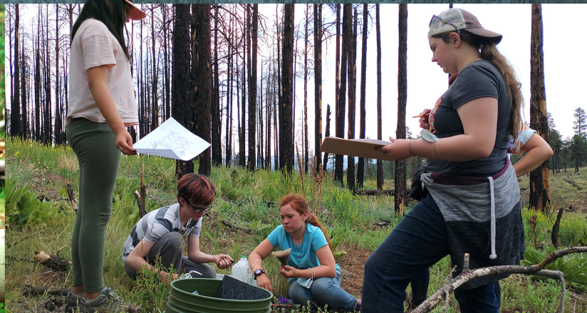
Students in the SEED Program investigate soil quality in a burned section of the forest