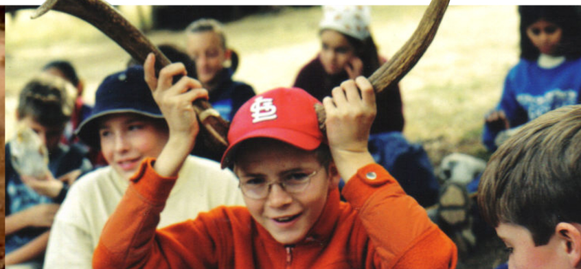
Sometimes the best way to learn about wildlife is to imitate it, as this student from the mid-90s demonstrated

“I remember spending time journaling in the woods [at Camp Colton]. It was a first-time experience for me to sit down alone and think deeply about what I was learning. Today, when I'm trying to solve a problem or work through a difficult situation, I use the skills I learned all those years ago to write down my thoughts and impressions.”