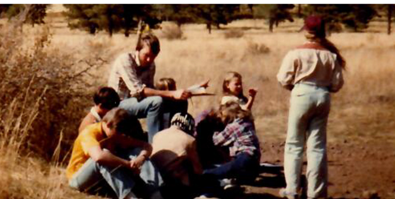
A group of students from the 1980s was immersed in an open-air lesson

Since 1971, Camp Colton has welcomed more than 44,000 students to Flagstaff's beautiful Hart Prairie. Going to camp has become a beloved community tradition and rite of passage. For the past 10 years, we have helped expand key programming, improve the camp experience and reach more children. Friends of Camp Colton's work is vital to ensuring future generations can enjoy Camp Colton. Thank you for being a Friend of Camp!