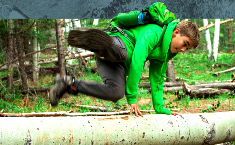
Kids explore Northern Arizona's lush woodlands, hurdling over fallen aspen logs

Hiring a new Camp Colton Program Coordinator will make our programs even more exceptional and adaptable to ever-changing needs. As the world begins to re-open, we're excited to help even more kids from across Northern Arizona experience the wonders of Camp Colton.