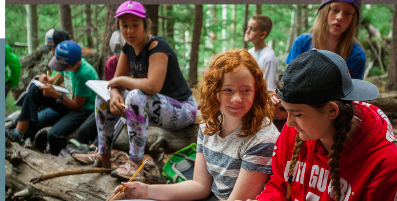
Reflecting on what they've learned, students journal at Viet Springs